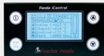
Panda iControl Panel