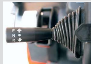
Simple, Small-Stroke F/R Lever The forward-reverse lever swings through a smaller arc than previous models, meaning less effort and less total time used during this basic, often-performed function.