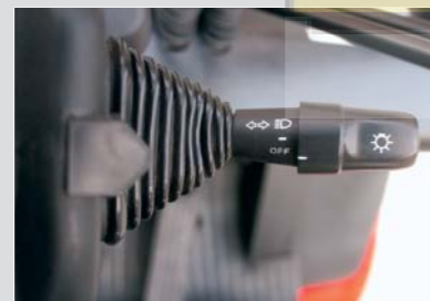
Automobile-Style Light/Turn-Signal Lever The automotive influence seen in the T Series extends to the thoughtful use of an automobile-style light and turn-signal lever, with simple actions that let the operator focus on the job.