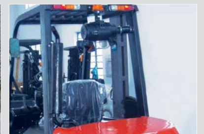
Option Special carriage and backrest Other dimension forks Dual drive wheel with fender Cabin Heater and air condition Dual air cleaner or special air cleaner Rear working light