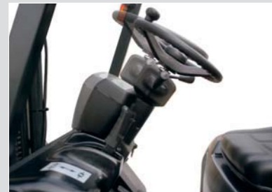
Adjustable Steering Wheel Steering wheel can be adjusted by a lever on the right-hand side for the most comfortable operator position.