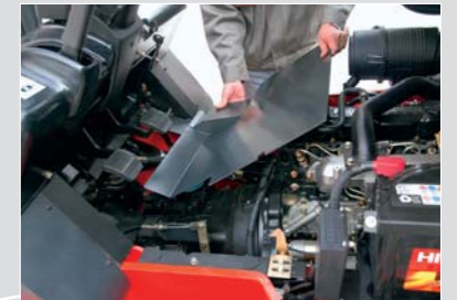
Easily-Detached Floor Panel One-touch removal of the floorboard gets you right to service operations and reduces down-time.