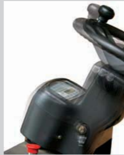
The adjustable steering Column ensure a comfortable working position.