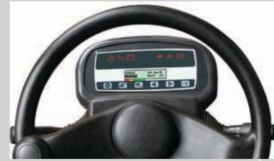
New Multi-Display employed full dotted LCD is located on the steering column to improve visibility and manipulate-ability.

DANAHER MOTION made high-frequency controller incorporates a powerful microprocessor together with MOSFET power electronics.